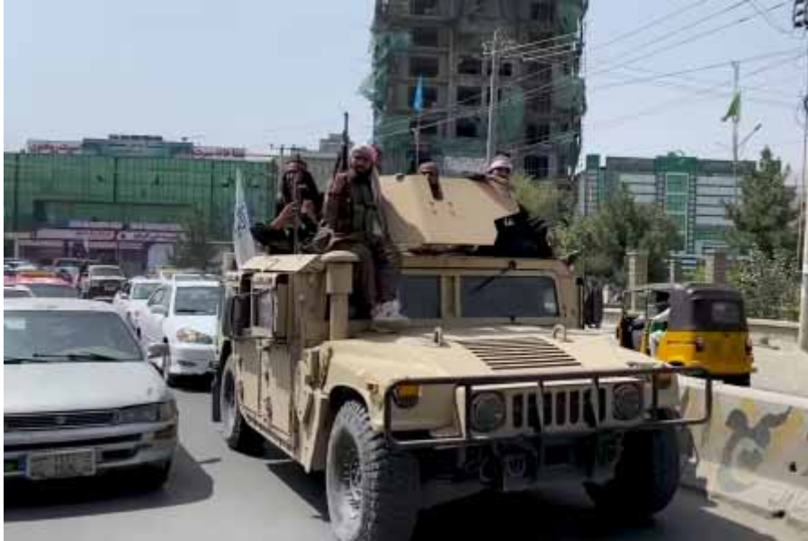
The Taliban patrolling Kabul, Afghanistan, August 17, 2021, public domain

Recall, Virginia, that doing nothing amounts to tacit acquiescence – if not passive approval – of the actions of the Goofball and his cabal. Re-arming the Taliban, providing them with U.S. military weapons which may be now, in fact, being turned against civilians is a direct result of the catastrophic decisions drooling out of the Oval Office’s Person of Slumber (“POS”).